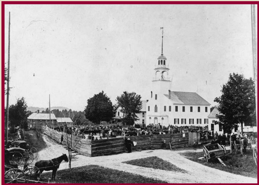
The 1878 Canterbury Town Fair