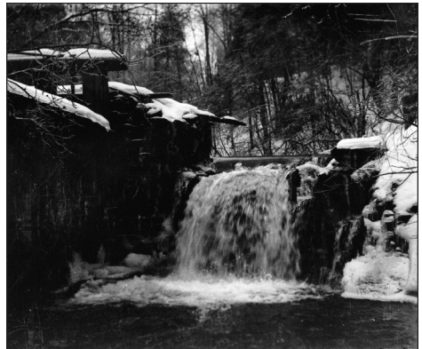
A winter shot of a dam on Forest Pond Brook.