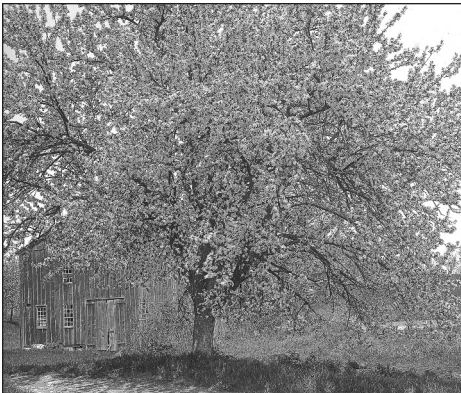
An apple tree in spring.