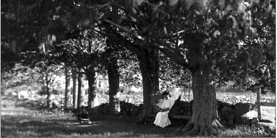
A woman and young child enjoy a summer day